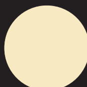
Cream Laid PERM