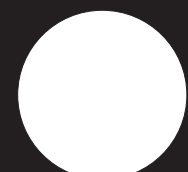
Cast Coated Opaque New PERM