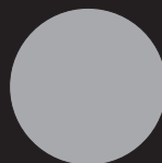
Matt Silver (NEW)

(Gloss Clear, Translucent and Gloss White also available as PCL3 Digital grades)